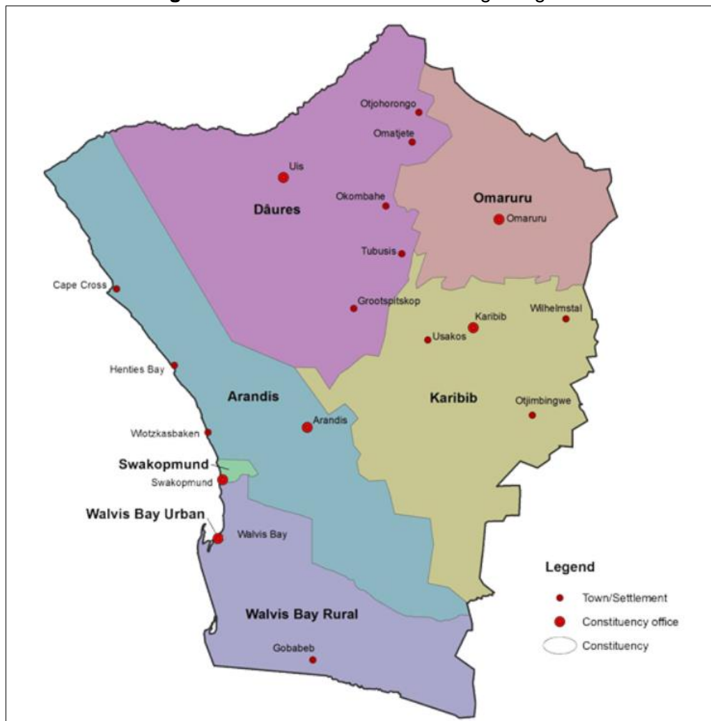
Figure 2. Constituencies in the Erongo Region