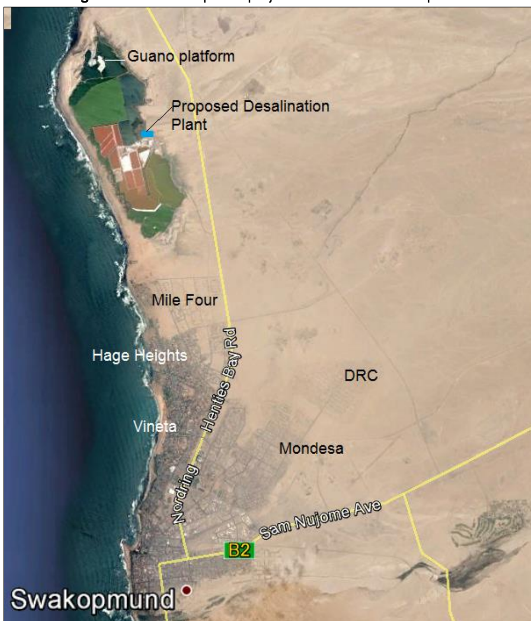
Figure 1. Site of Proposed project in relation to Swakopmund

The construction period is expected to be approximately 18 months. During the operational phase, the plant will be staffed with an estimated 12 to 18 contract staff working on a shift basis as required. It is