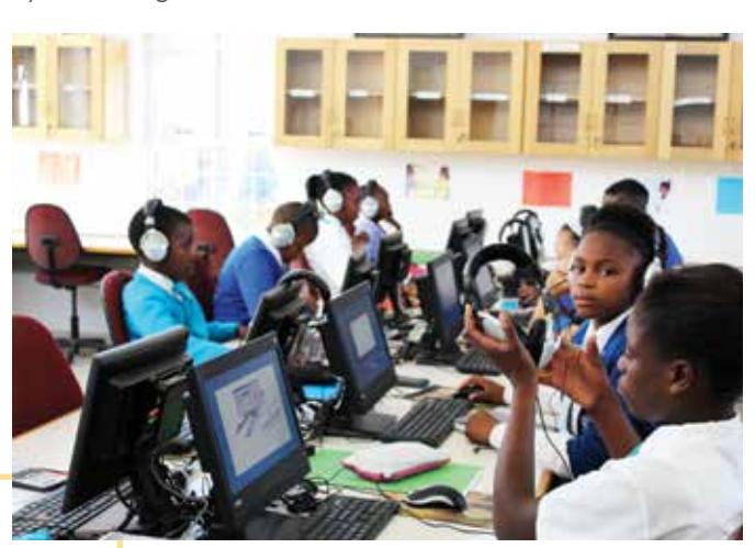
Learners from the Swakopmund Secondary School during the Mathematics sessions at Rössing Foundation Tamariskia Centre.

Special training was conducted for 26 Junior and Senior Primary school learners in Natural Science and Health Education and also on some communicable diseases such as Hepatitis E.