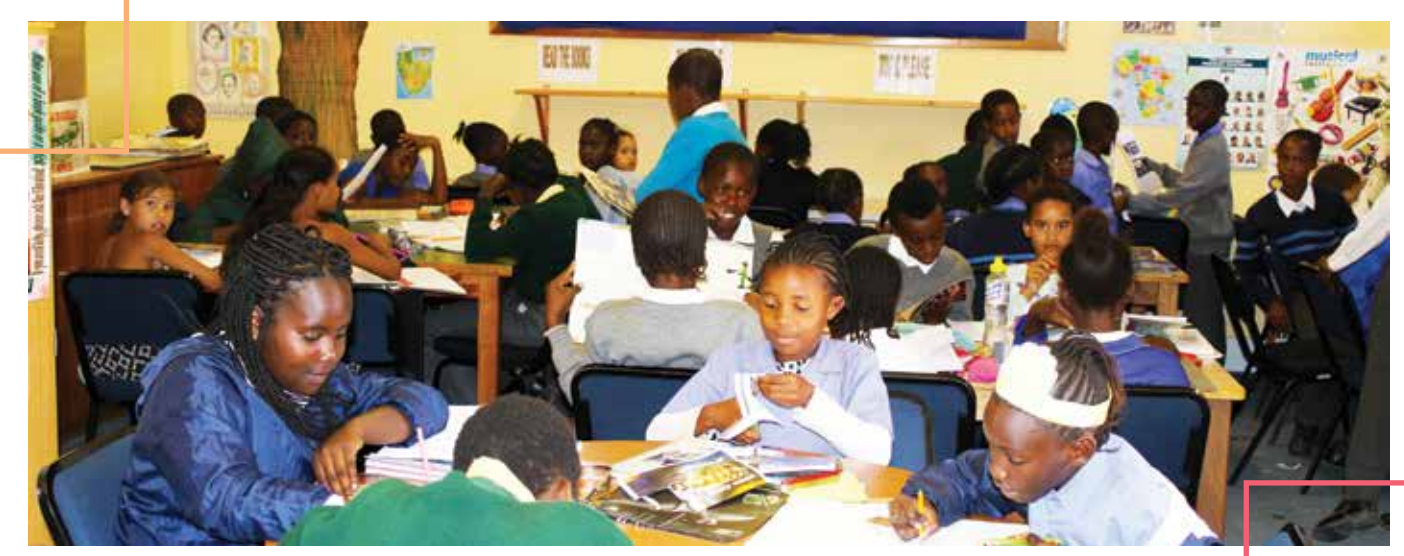
The Rössing Foundation libraries continue to provide information to the general communities in Arandis, Ondangwa and Swakopmund. The learners, teachers and community members come to the libraries to study, do research, homework and other projects.