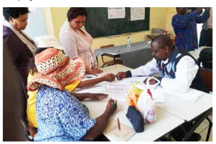
A group of school board members at work during the training workshop.