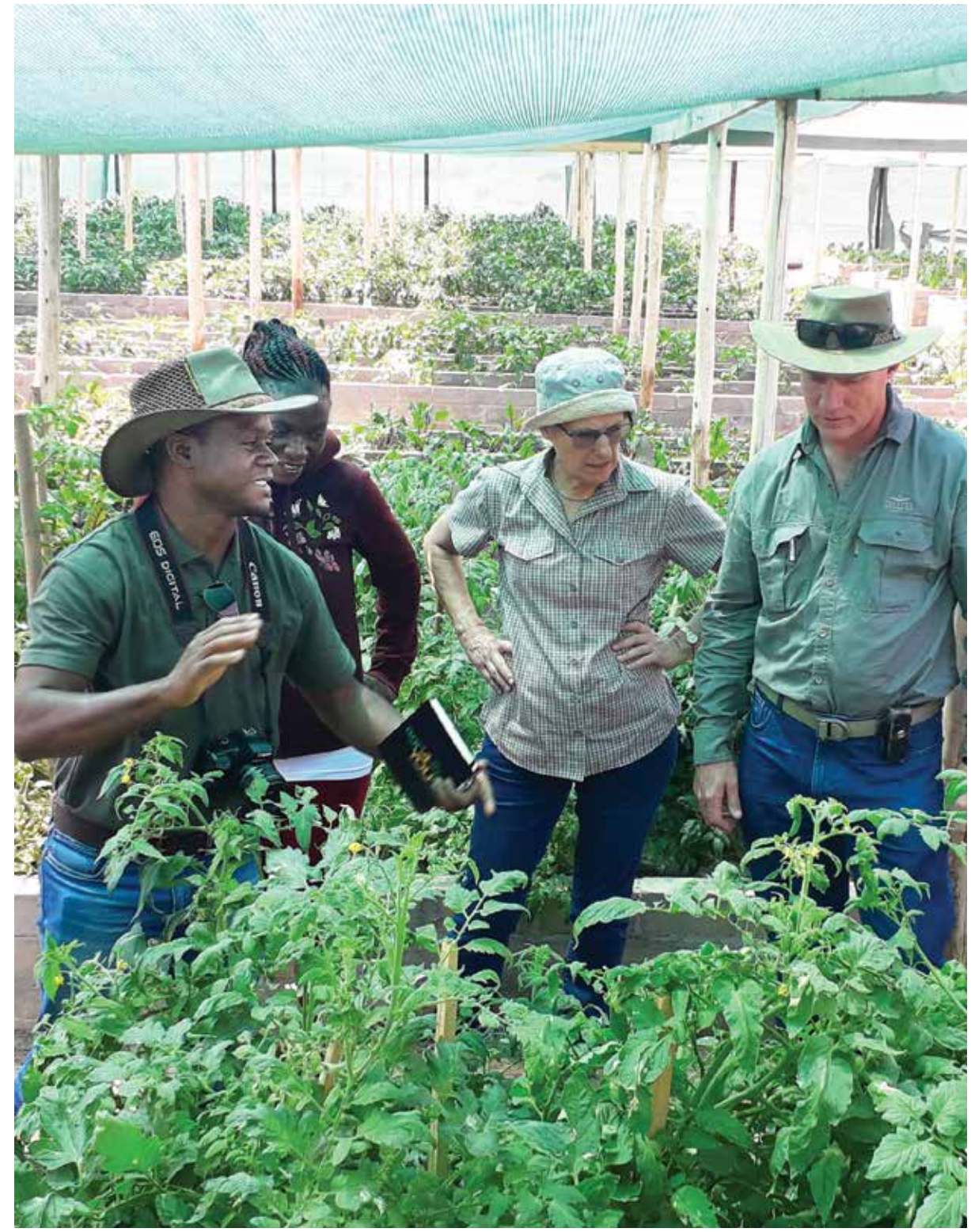
Visitors to the Dreamland Garden project in Arandis.