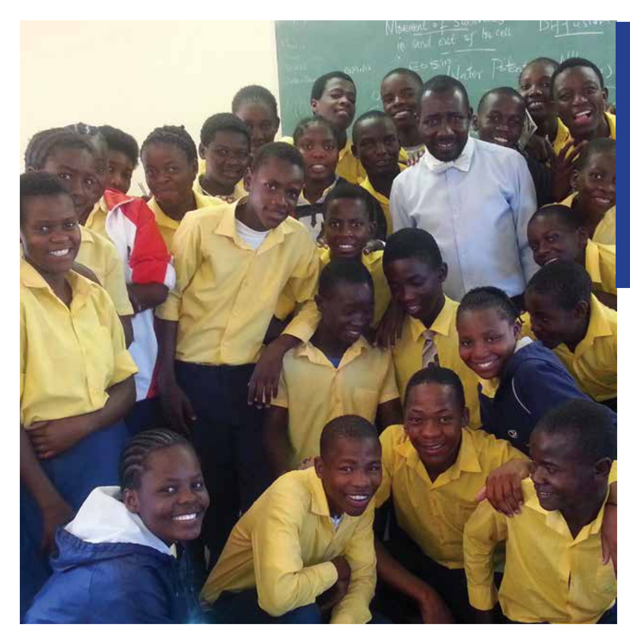
Learners of the Usakos Secondary School during holiday classes.