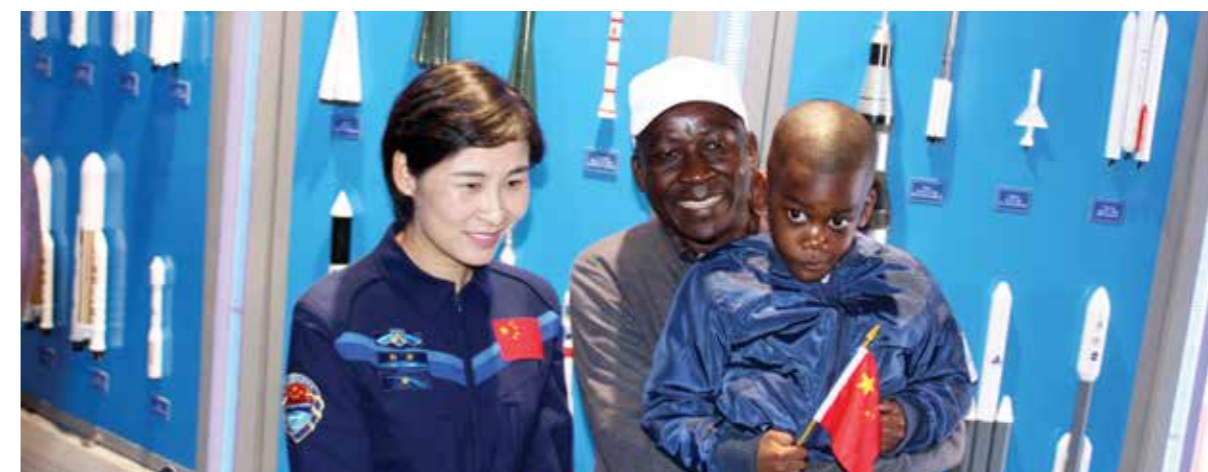
The first female Chinese astronaut, Liu Yang, flanked by Natumutange Uusiku held by his father, Lysias Uusiku of the Rössing Foundation.

and astronomy by two Chinese astronauts, Liu Yang and Chen Dong. Liu Yang is China's first female astronaut to venture into space.