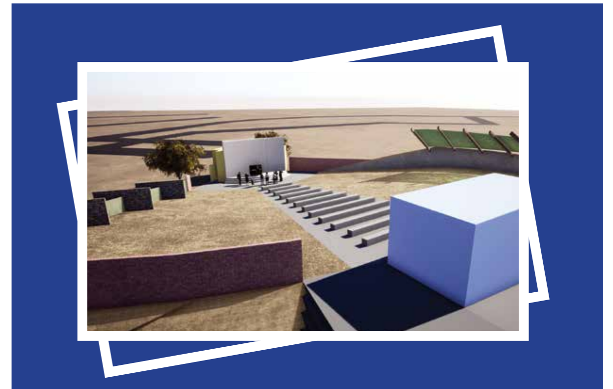
Architectural drawing of the envisaged amphitheatre in Arandis.