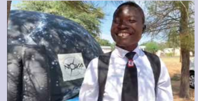
Learners of the Mokganele Thlabanelo Senior Secondary School participated in the piloting of the Mobile Planetarium.

Physics, Chemistry, Mathematics, Geography and Biology.