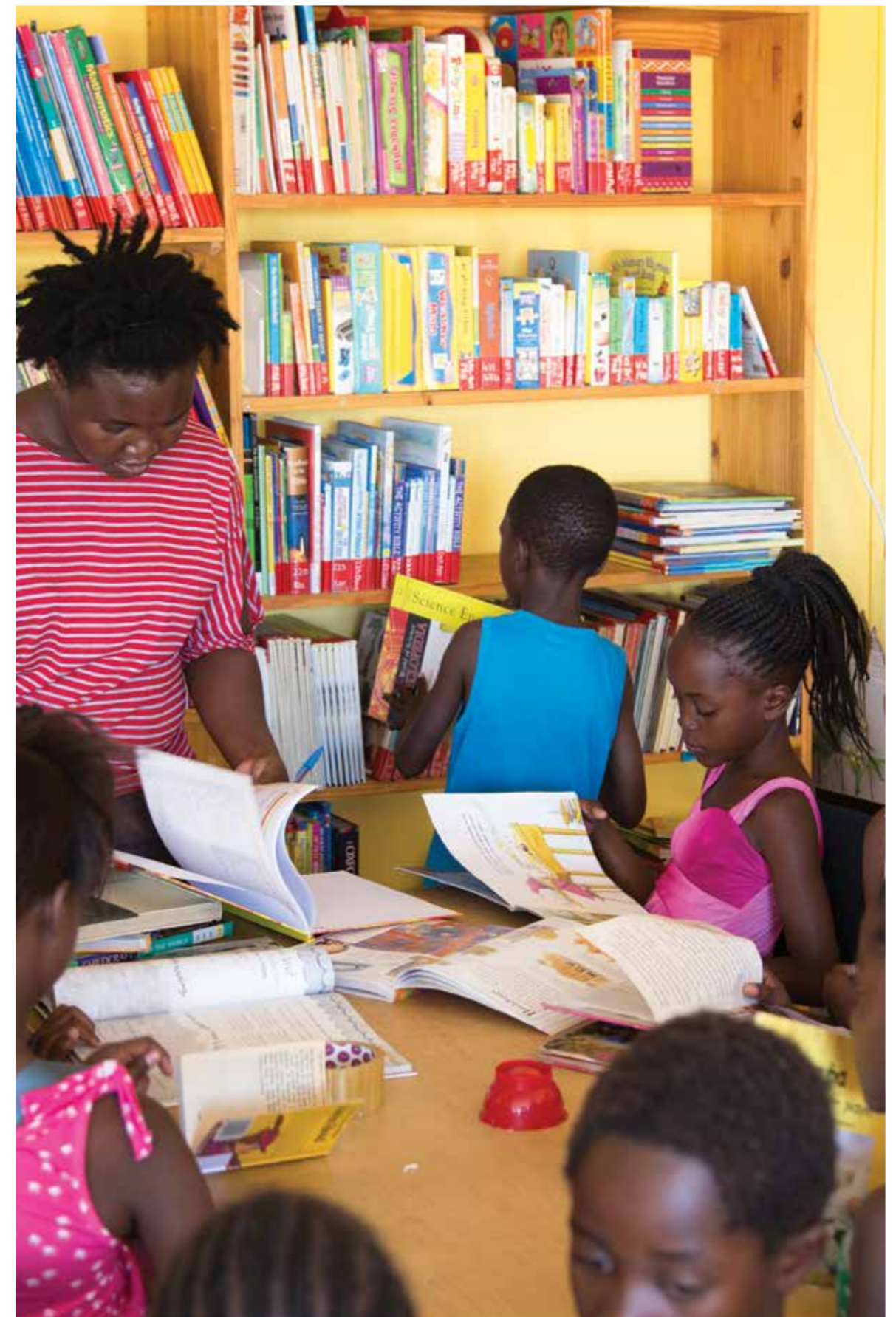
The Rössing Foundation libraries benefitted the teachers, learners and community members by providing access to books and electronic media.