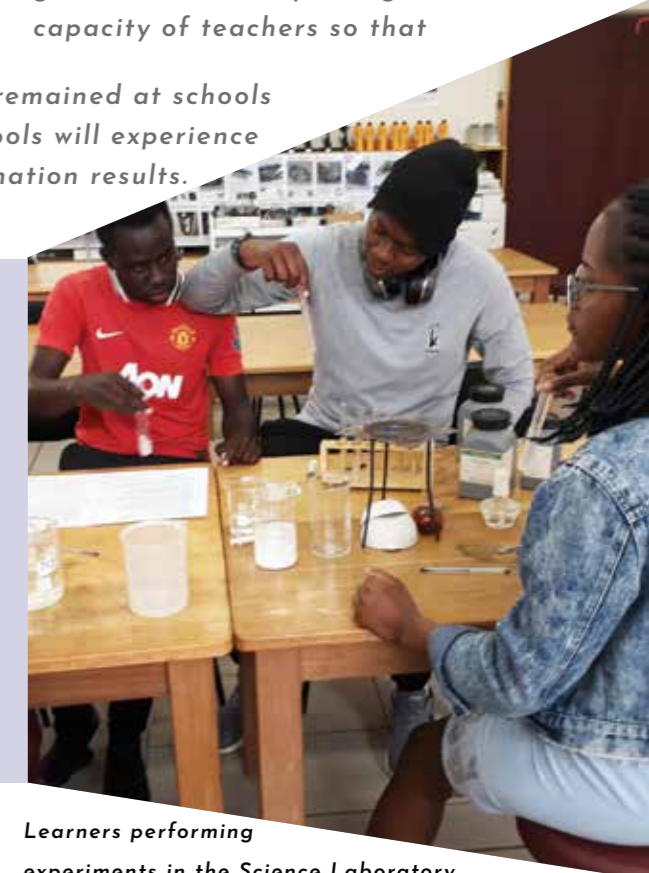
Learners performing experiments in the Science Laboratory at the Tamariskia Centre.