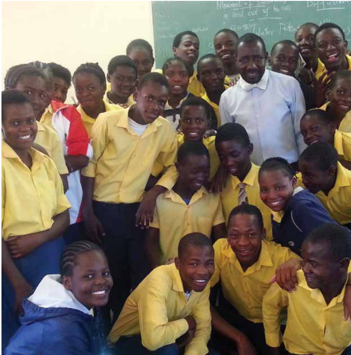
Learners of the Usakos Secondary School during holiday classes.