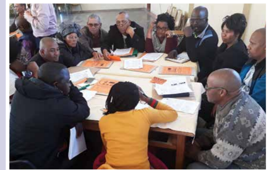
A group of teachers, parents and other community members during the training of School Boards of the Hardap Education Directorate, Hardap Region.

The Rössing Foundation was established in 1978 through a Deed of Trust to serve as a vehicle for overseeing and implementing Rössing Uranium's corporate social responsibility activities in Namibia.