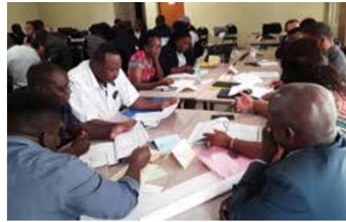
Group work in progress during Training of School Board Trainers of Kunene Education Directorate in 2019.

The objective of the training was to enable the Master Trainers to use the Social Accountability and School Governance Tools to empower School Board Trainers to be able to capacitate school boards in their regions, circuits and schools.