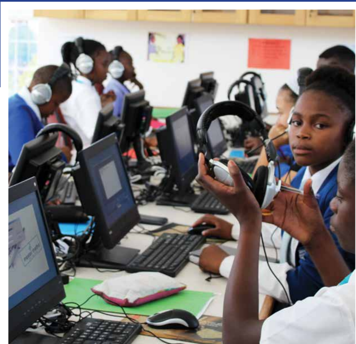
Learners at the Tamariskia Centre, participating in the Master Maths class.