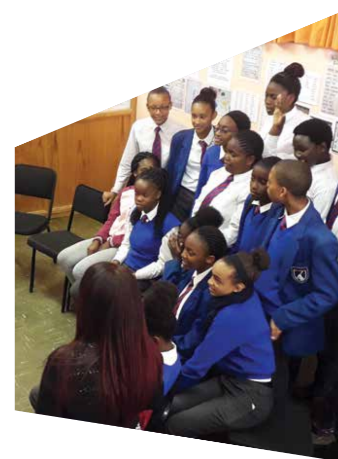
Learners from the Westside High School in Swakopmund attending holiday classes at the Tamariskia Centre.

A total of 598 learners from different regions in Namibia attended the August 2019 school holiday classes at the Rössing Foundation Centres. These learners came from Kunene and Kavango West regions, some from schools in and around the Ondangwa Centre, while the rest came from Khomas Region. In addition, local schools in Swakopmund also benefitted from the holiday classes at the Tamariskia Centre.