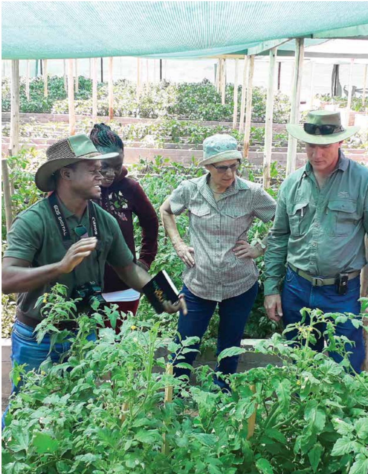
Visitors to the Dreamland Garden project in Arandis.